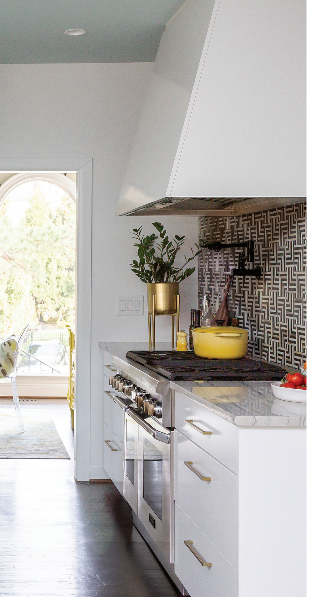
LEFT: The eight-foot kitchen island features a waterfall quartzite countertop fabricated by Carolina Kitchen & Bath, and an Arteriors chandelier above creates a statement. Clear Gabby counter stools sit pretty, provided by Ashley DeLapp Interiors.

Abees were ready for a major change, without sacrificing their love of color."